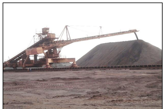
Stacker creating iron ore stockpile